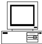
Design Label Using BAR-ONE